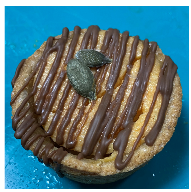
Pumpkin & Cottage Cheese treat by Oksana

Vlad asked me to preach and teach Bible Class. We were warmly greeted by the members of the congregation and they paid close attention to the sermon. Their Sunday morning is backwards from